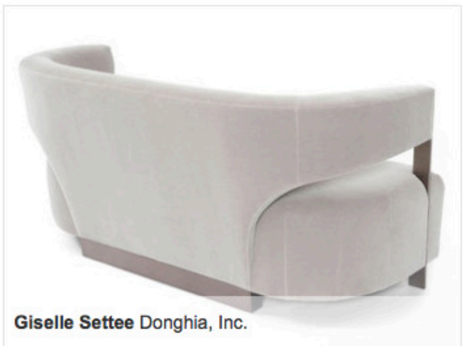
Giselle Settee Donghia, Inc.